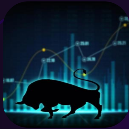
Indian Stock Market